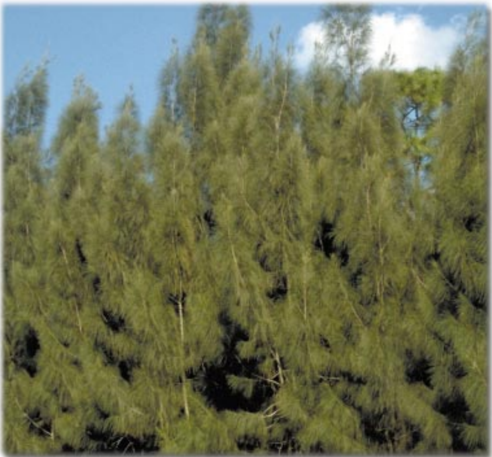
Monoculture, Indian River County