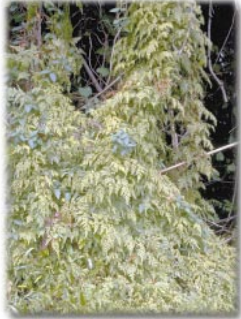
At hammock edge, Gulf County