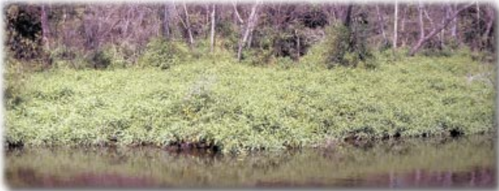
Thicket along Peace River