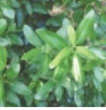
Myrsine - ( Rapanea punctata )