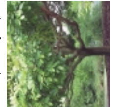
Paradise Tree - ( Simarouba glauca )