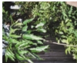
Florida Soapberry - ( Sapindus saponaria )