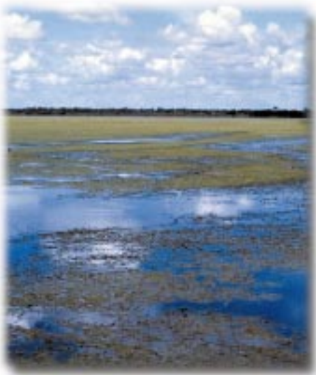
In Lake Trafford, Collier County